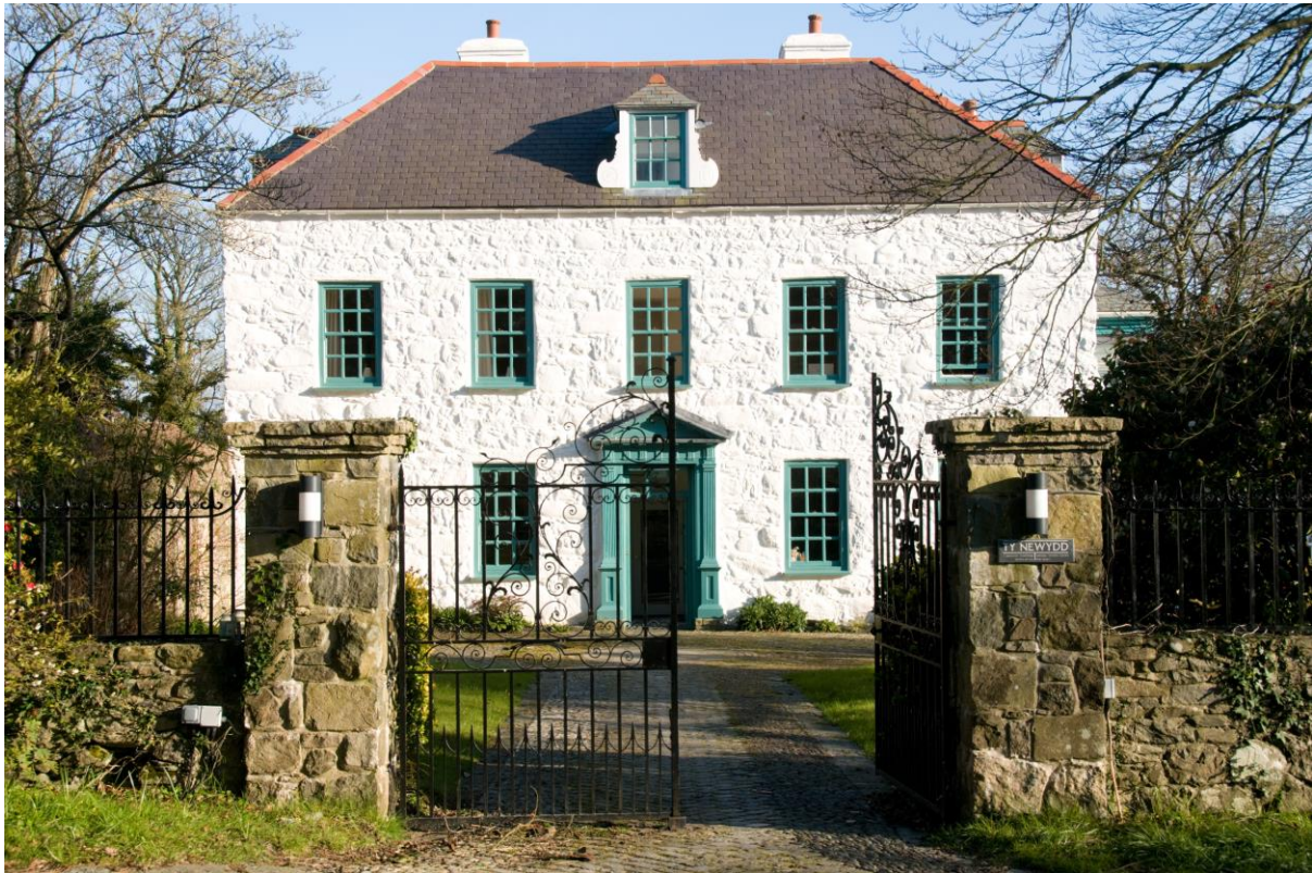
Tŷ Newydd Writing Centre.

Developing more diverse income streams at Tŷ Newydd has been part of a significant campaign to ensure that Literature Wales works on a sustainable business model and provides value for money. As an organisation that receives public funding, we take this responsibility particularly seriously. Since being established we have increased our turnover by 12%, and each year we secure over £1.8million in extra investment in literature, in addition to core funding. For every £1 invested in Literature Wales by our core funder, the Arts Council of Wales, an additional £2.50 is generated. For example, the funding for Writers on Tour, the funding scheme that supports local literature activity, generates an additional £114,000. Overseeing this side of the business and working to ensure its sustainability are key responsibilities for all Directors