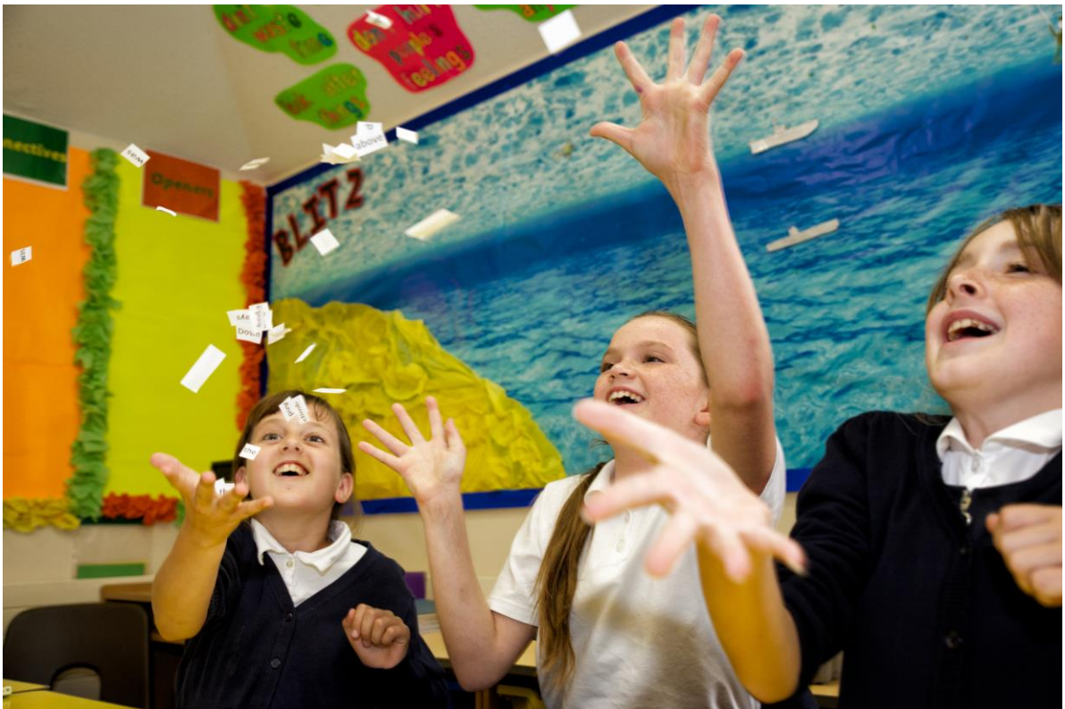
Developing Dylan Project.